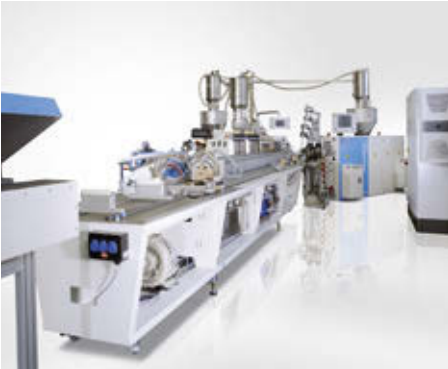
Perfectly matched calibration cooling channel