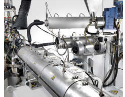
Extrusion head for up to 5 different compound components