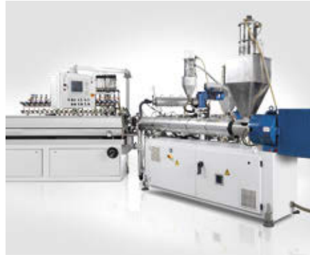
Central operator panel for easy control of the profile production line