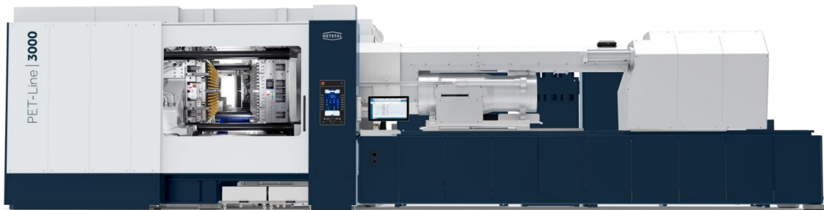
Symbol image (series)

You benefit from a large process window as well as low AA values and a low IV drop.